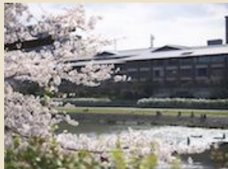
The Ritz-Carlton, Kyoto