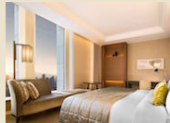
The St. Regis Osaka